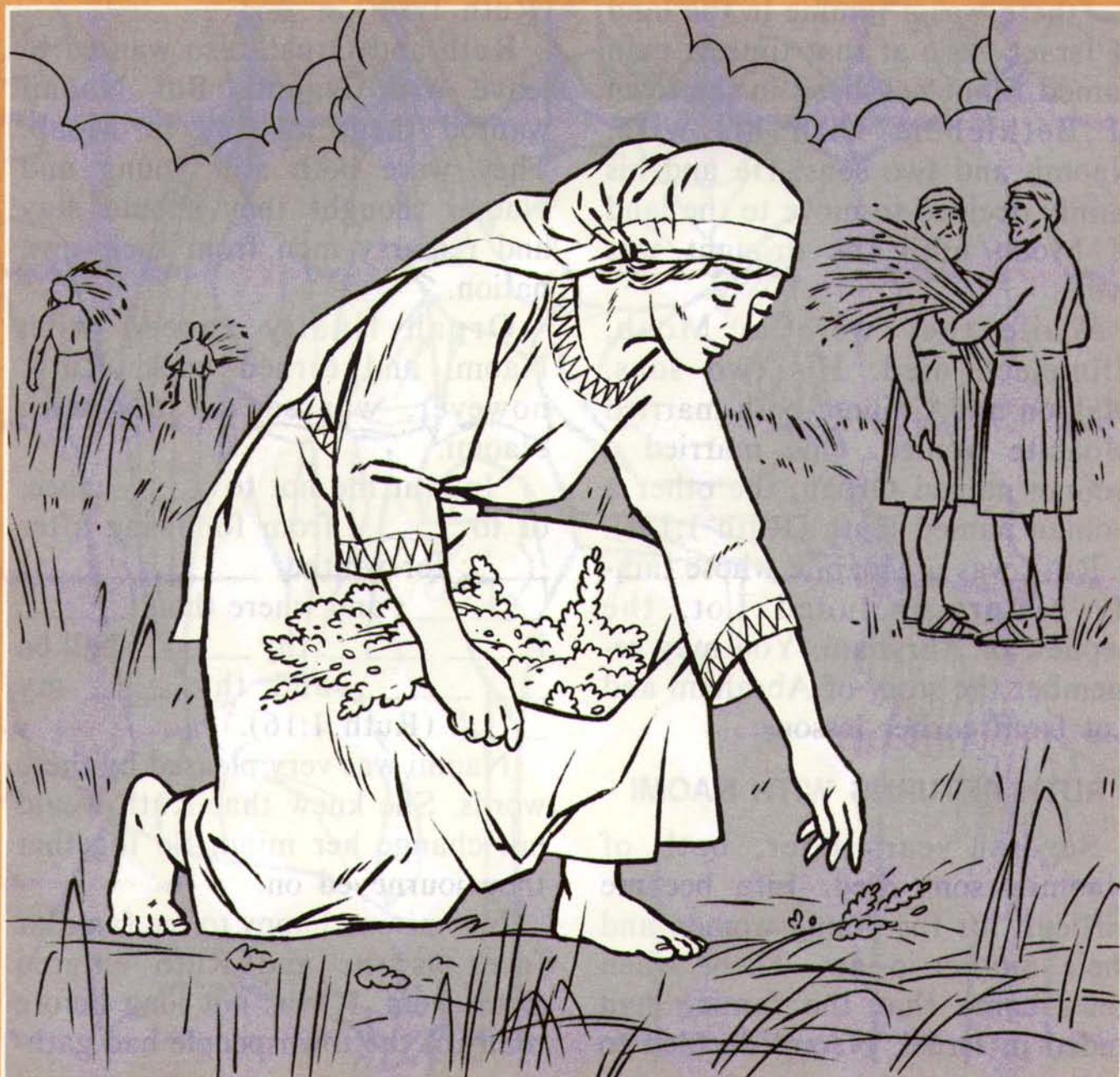
Ruth—A Virtuous Woman